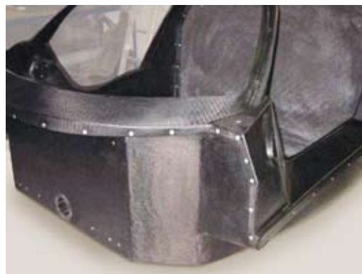
CFRP prepreg structure (bodywork part), made with ebacryl tools