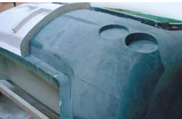
Design model from block material