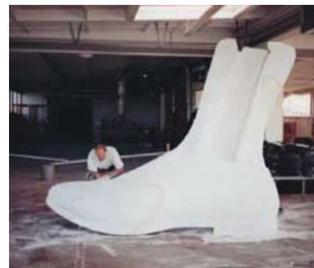
Expanded polystyrene scenery with ebacryl coating