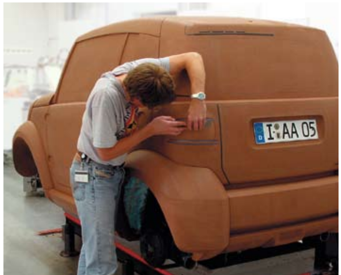
Clay design model

The laminates can be removed from the mould after 2 to 3 hours. We recommend that they are left to set overnight. We will be pleased to provide more detailed instructions, just give us a call: +49 9861 7007-0